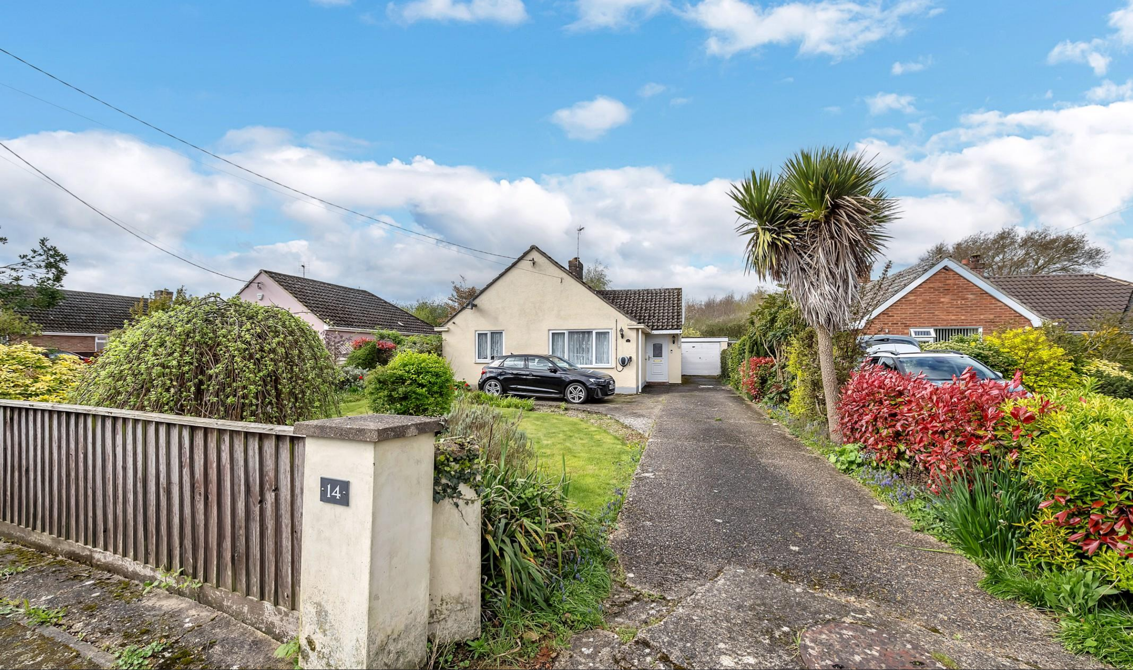
Mill Lane, Barrow, Bury St. Edmunds, Suffolk, IP29 5BS